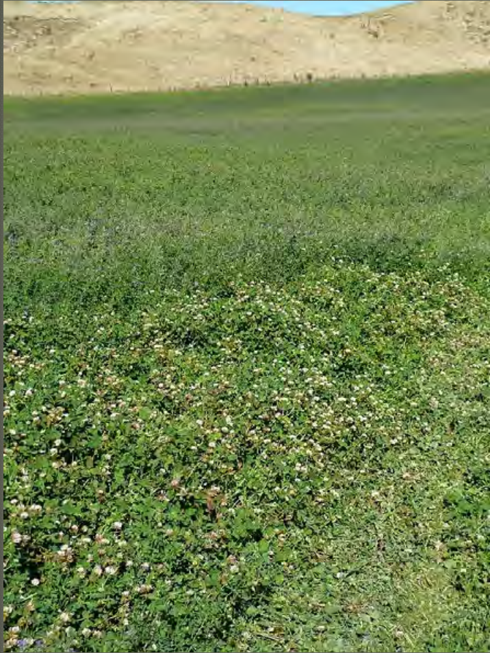
Wet area in foreground of new lucerne paddock 2011/12