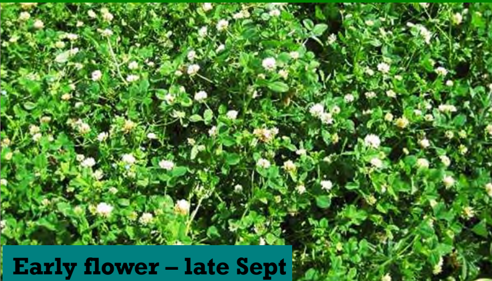
Early flower – late Sept