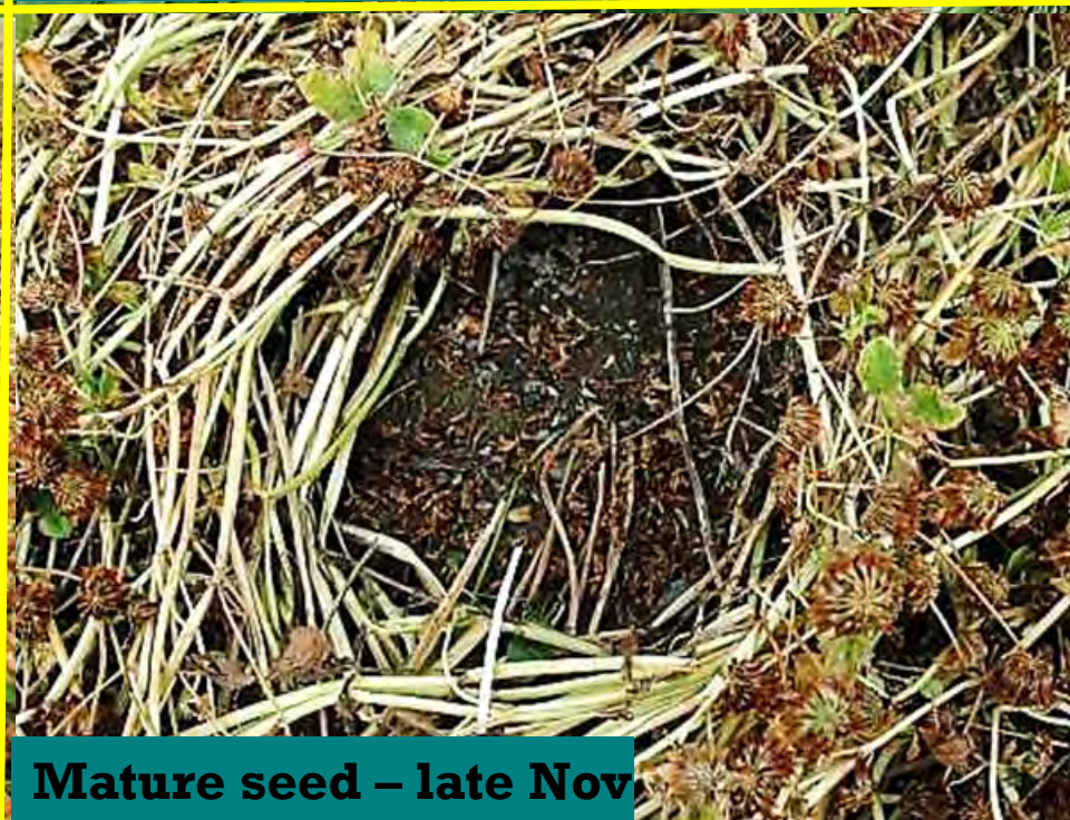
Mature seed – late Nov