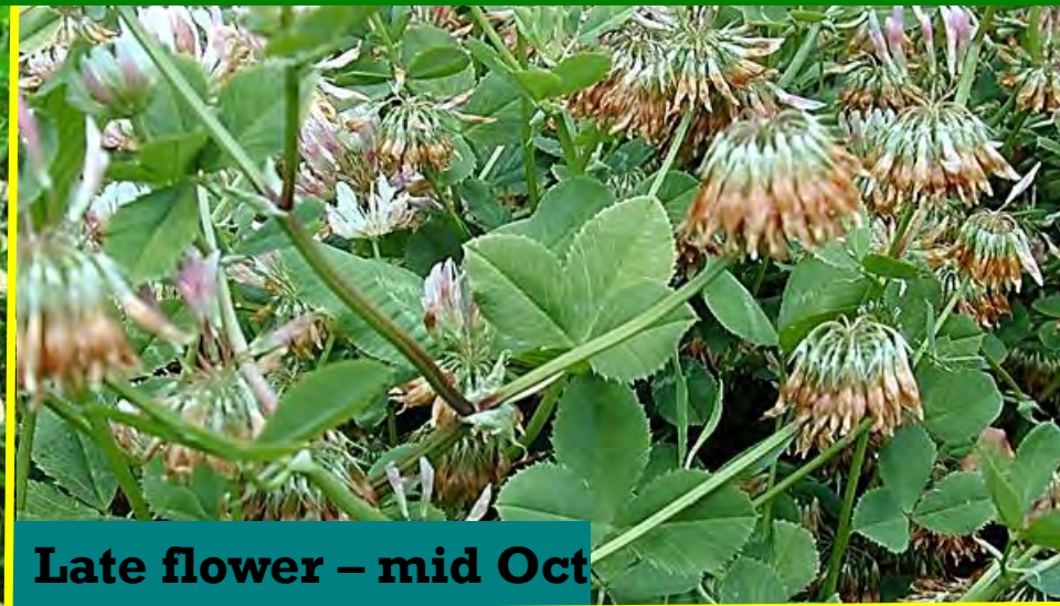
Late flower – mid Oct