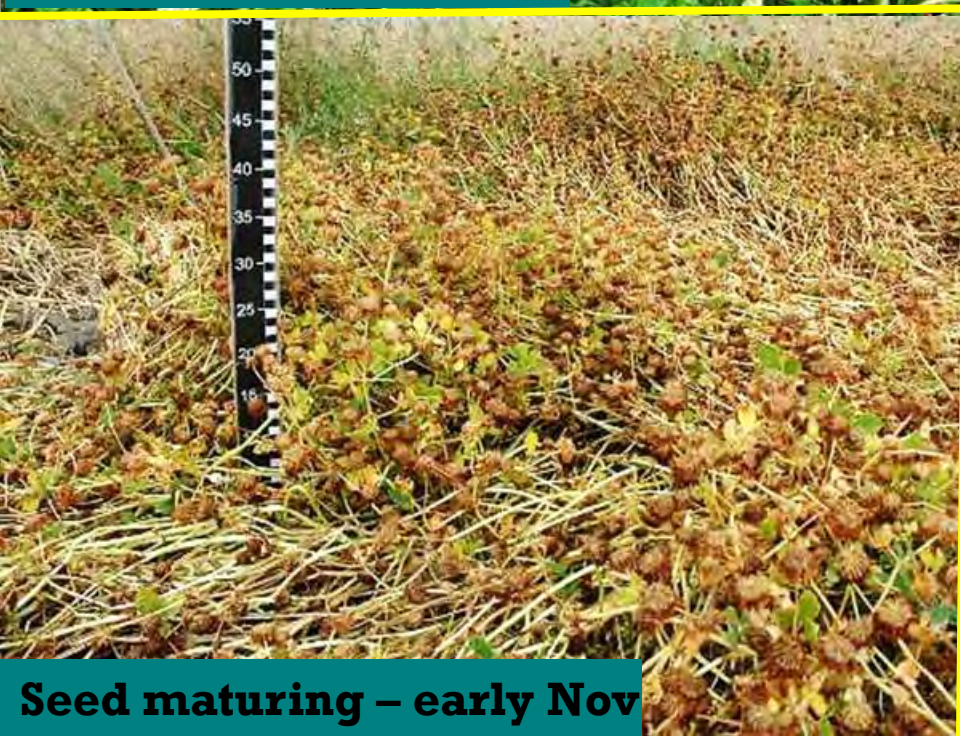
Seed maturing – early Nov